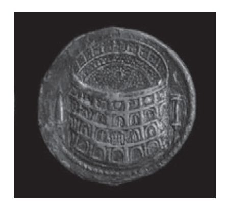
Previous page Medal commemorating the Beheading of the King and Queen of France, 21 January 1793 on the (future) Place de la Concorde. Above Brass Sesterce with the Colosseum, issued by Emperor Titus, 80 AD.

a montage: an aerial overview with the lateral façade projected onto the ground and ships seen head-on.<sup>4</sup> On the other end of the scale, relatively small objects, such as the Temple of Janus (the altar of peace), also find their place on coins, as do triumphal arches and pieces of sculpture.