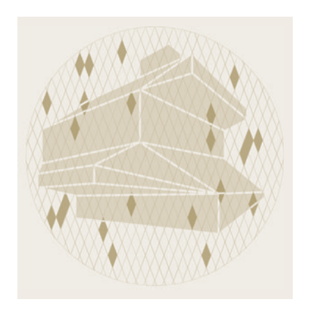
Francesca Bucci-Vernizzi, Timothy Myron and Gregory Nakata, Medal of Rem Koolhaas's Seattle Public Library.

The only way to render extended spatial relationships within the shallow relief of a coin is to collapse them into a single foreshortening. Baroque coins privilege the depth of city views and the lengths of