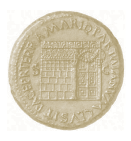
Temple of Janus. Coin from the time of Nero (54 to 68 AD) The doors of the temple are closed in peace time.

There are iconic buildings that coalesce in a single figure, such as Frank Lloyd Wright's Guggenheim Museum, in New York City. Not only does it stand for private patronage, as did ancient objects of munificence or Renaissance palaces, but it also possesses a unique architectural character in its allusion to the Pantheon. By adapting the curvilinear surface of the building to the circular shape of a coin, this modern medal demonstrates how one can make, even in hindsight, a fitting commemorative image; and the coin's realization in silver adds qualities of richness, finish, and simplicity.7 Like the silver dollar, the Guggenheim Museum coin has a touch of munificence and exceeds its value as common currency.